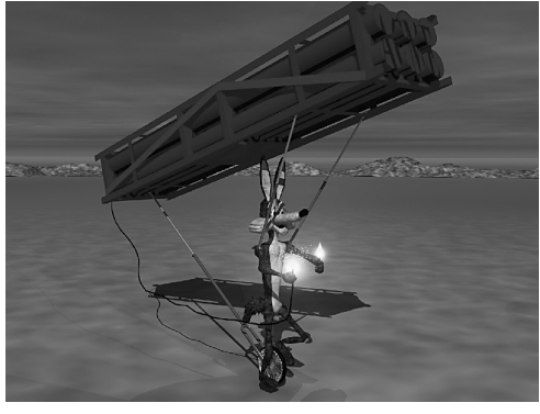
Advanced Carriage Missile Erector ( ACME ) Concept<sup>42</sup>

say that, "I commend my comrades on the barricades in Seattle". I can't do that with a straight face , so I'll just say, " You Go Girl! "