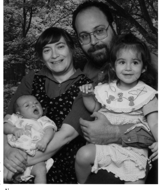
The Usual Suspects

This Spot Left for Mailing Sticker This Spot the hapless helicopter. It seems that the program